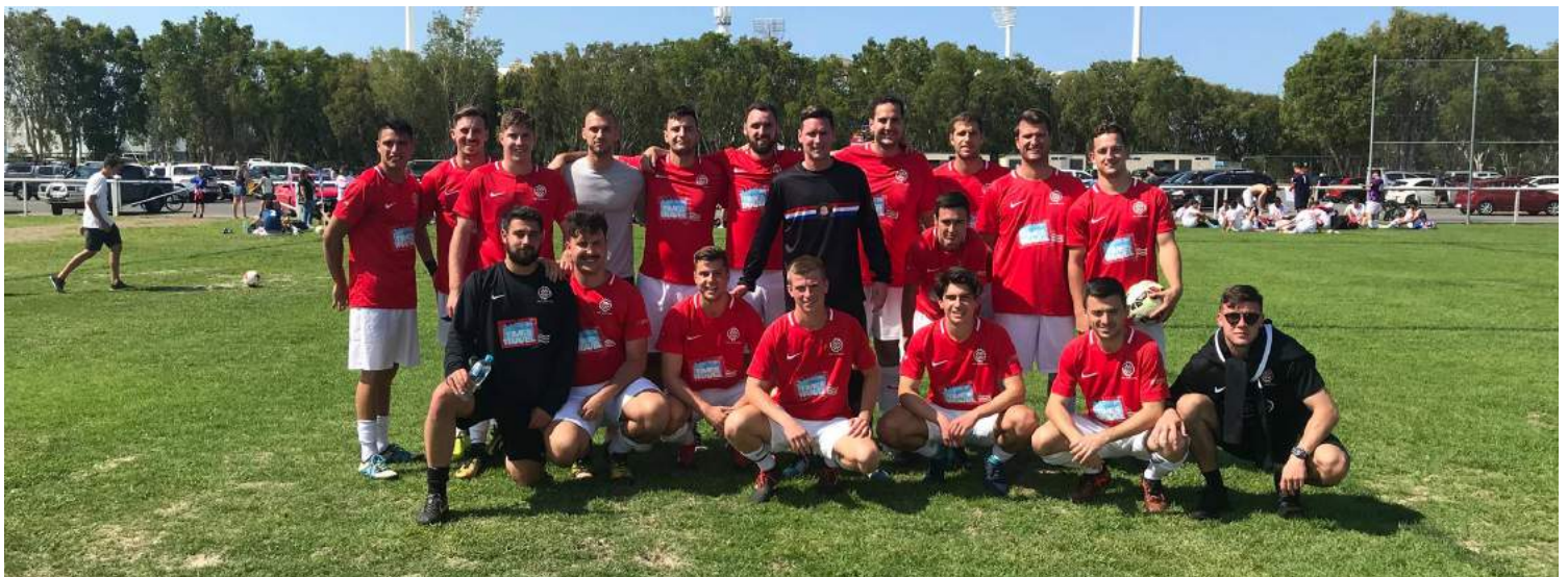
HNK Auckland with legend Shane Smeltz at the 44th Croatian Australia New Zealand Soccer Tournament 2018, Gold Coast