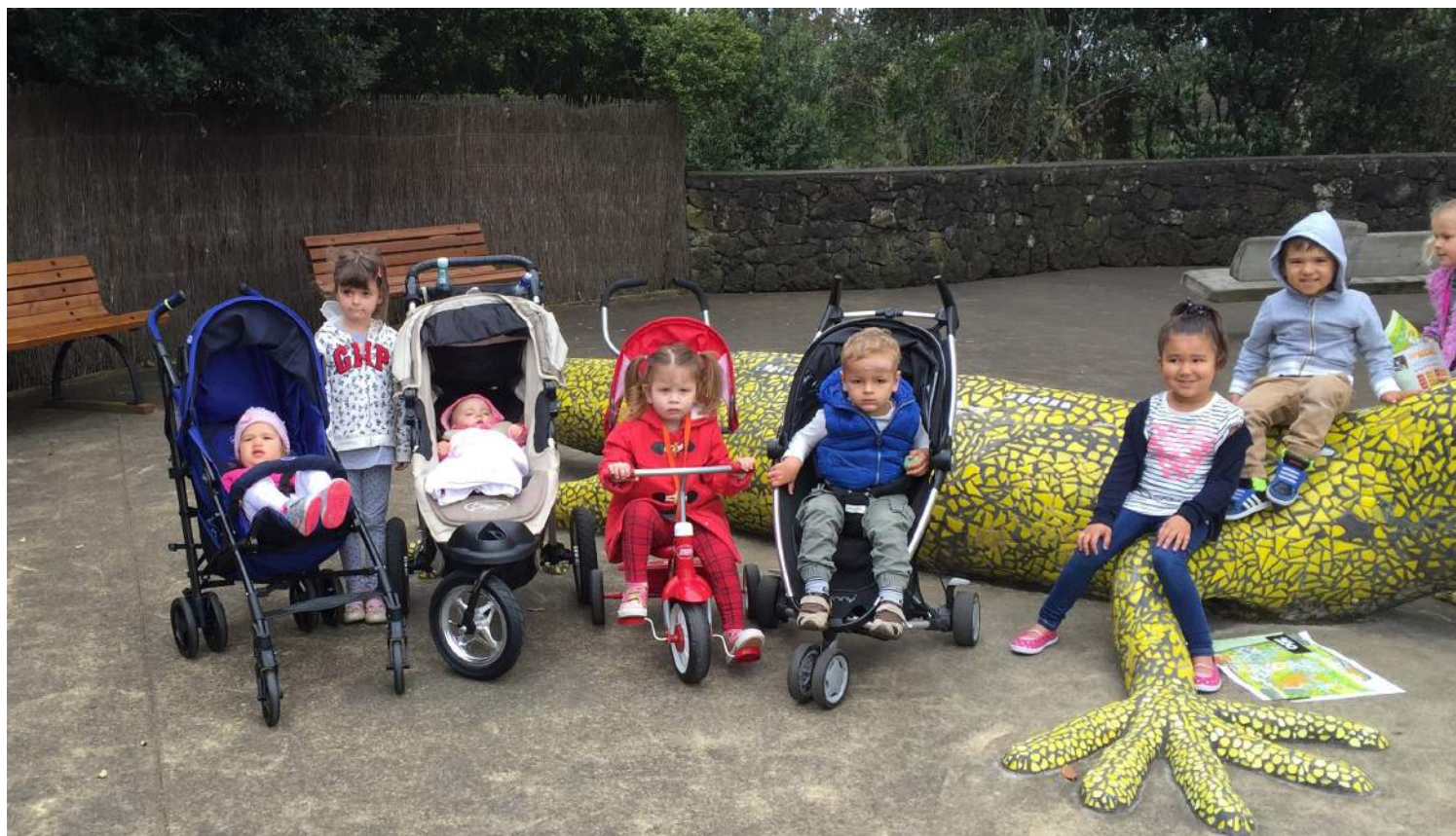
Kids playgroup trip to Auckland Zoo - Friday 16 th October