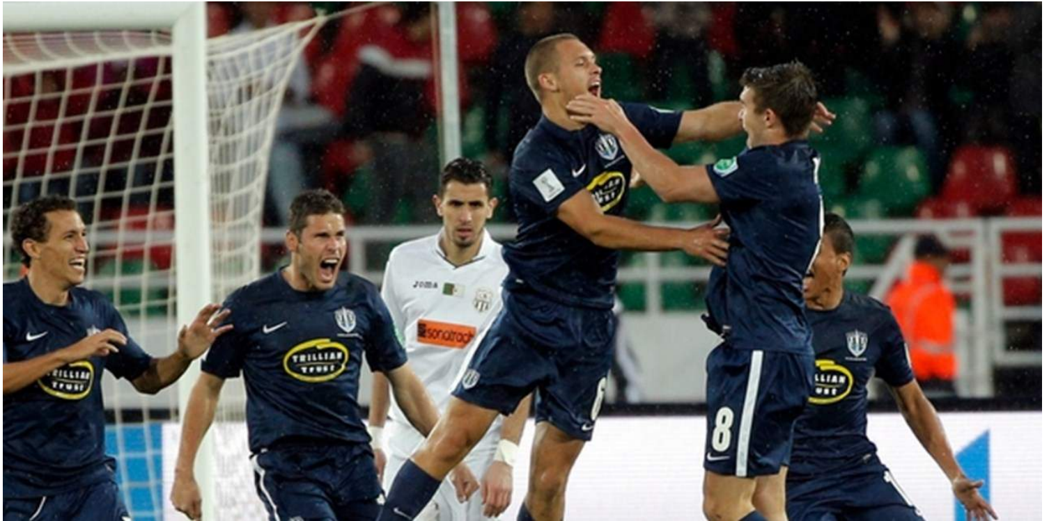
Auckland City FC players celebrate their quarter-final win